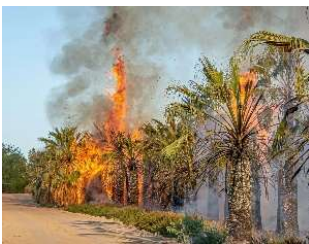
Palm trees burning: https://youtu.be/4ntvLjvtwyQ

Palm Trees: Palm trees of all types need to be maintained free from dead palm fronds.