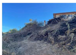
Acacia after fire

VCFD recommends removing any hazardous vegetation such as Junipers, Italian Cypress, and Acacia.